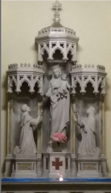
Rosary Shrine at St Laurence's Church

That is the full title under which our Prospect church was established, according to the foundation stone at the right of the front door. (but it is in Latin there)