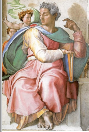
Isaiah by Michelangelo, Sistine Chapel

Readings from the Prophet Isaiah dominate the Old Testament readings during the season of Advent. By calling these Old Testament figures prophets, we mean that they speak in the name of God. In Michelangelo's fresco, there is an angel drawing Isaiah's attention to the message from God.