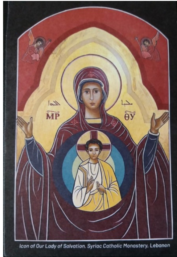
Icon of Our Lady of Salvation, Syriac Catholic Monastery, Lebanon

The single most effective response we Christians have is prayer. "Prayer is the meek and holy force to oppose the diabolical force of hatred, terrorism and war." Pope Francis