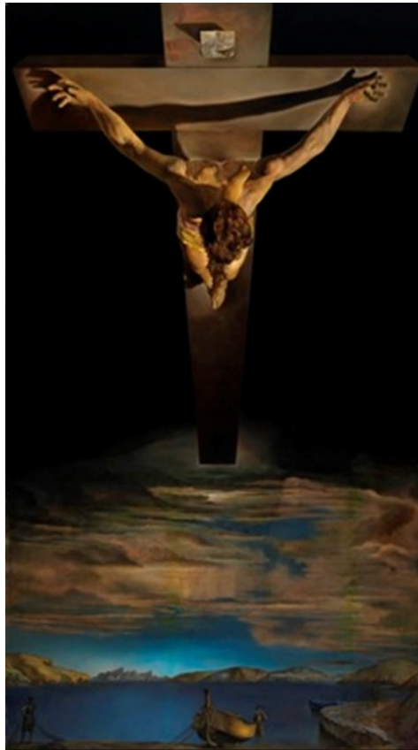
Christ of St John of the Cross; Salvador Dali