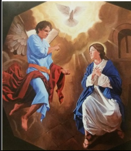
The Angel of the Lord declared unto Mary, and she conceived of the Holy Spirit.