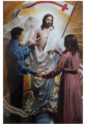
The Sacraments flow from the Incarnation

The Incarnation is one of the most foundational and central beliefs of Christianity. Along with the Resurrection, it is at the heart of the Good News and of all our teachings, Sacraments and saints. Without the Incarnation there would be no reason why Our Blessed Lord's words would have more significance than the words of Moses or any other of the prophets and His saving death on the Cross would not have been the same extraordinary act of God's lowering Himself for us.