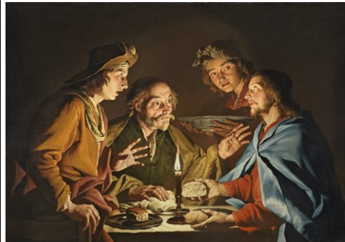
Jesus is forever Emmanuel, God with us.